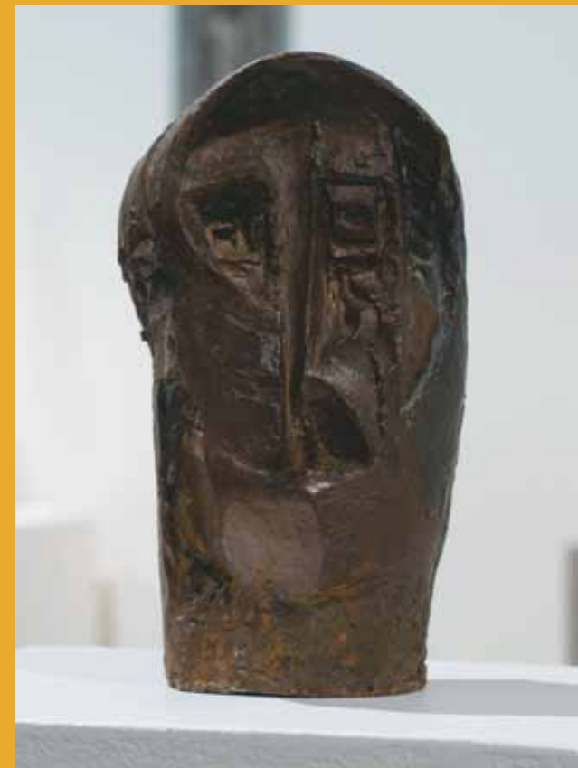
Image: Macbeth , 1966. Ian Bow. Bronze. Mildura Arts Centre Collection. Collector Father; Artist Son installation view.