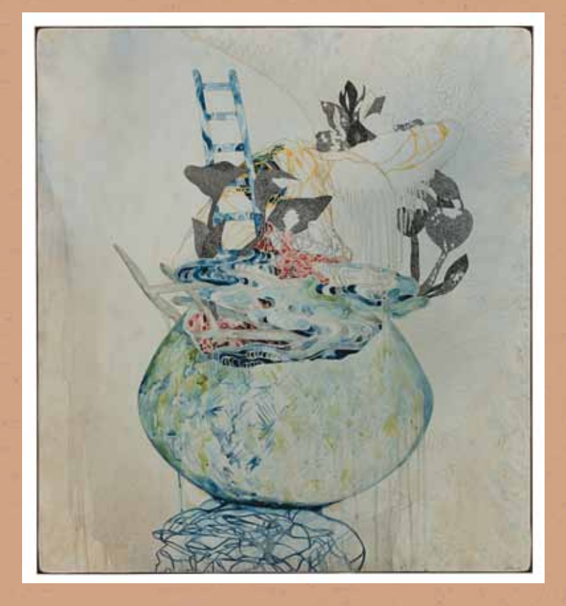
Image: Geoffrey Ricardo, Factory Kite , 1991. Etching and drypoint. Mildura Arts Centre Collection, acquired 1992.

A diverse range of paintings and works are presented in this exhibition. The artworks are recent acquisitions for Mildura Arts Centre's permanent collection.